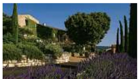
Coquillade Provence Resort &amp; Spa

Coquillade Provence Resort & Spa, an elegant hillside hotel overlooking France's Luberon National Park, re-opened last summer with 63 rooms following a significant transformation. Surrounded by 42 hectares of vineyards, lavender fields and forest, it has an exclusive cycling center for guests to discover the Provençal way of life on two wheels. Cycles can be bought or hired to discover destinations such as 'Les Ocre's'—the 'Provençal Colorado'—with its radiant ochre colors. Routes allow time to stop and enjoy a locally sourced picnic, the wine and the view. For the more extreme cyclist, there's an ascent of Mont Ventoux accompanied by the center's cycling coach. The hotel's award-winning 1,500-square-meter spa offers various sports massages to eliminate toxins and release muscular tension, after exploring