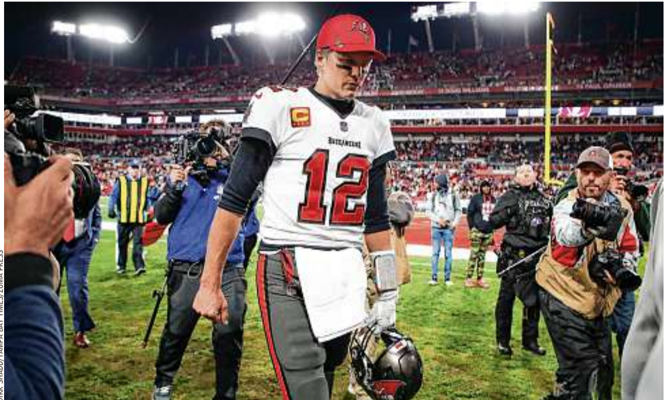
NOT TO BE: The Tampa Bay Buccaneers lost to the Los Angeles Rams Sunday after clawing back from 27-3 to tie the game in the fourth quarter, before the Rams won with a field goal. The Kansas City Chiefs beat the Buffalo Bills 42-36 in overtime. A16