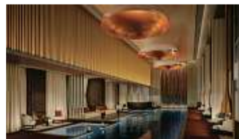
Aman New York

New York sees the most anticipated opening of 2022 with the Aman New York, which will bring a touch of serenity to Midtown's famous Crown building overlooking Central Park on 5th and 57th. For social buzz head to Nashville, the new hipster hotspot, which sees the arrival of Four Seasons Hotel & Private Residences Nashville and Conrad Nashville, which will pair southern hospitality with modern luxury.