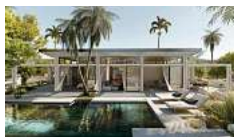
One&amp;Only Aesthesis | Credit: One&amp;Only Resorts

Sun-chasers should head to One&Only Aesthesis, a Grecian escape in 21-hectares on the Athenian riviera, while skiers await the opening of Six Senses Crans-Montana in one of Switzerland's most prominent ski areas. City-lovers are anticipating the opening of Six Senses Rome, designed by Patricia Urquiola inside an 18th-century building near the Trevi Fountain and the Pantheon. Expect a rooftop terrace, organic garden, trattoria, and a spa inspired by ancient Roman baths. In Paris Maisons Pariente, the group behind Hôtel Le Coucou in Meribel, opens its first boutique urban hotel, Le Grand Mazarin, in the Marais during September.